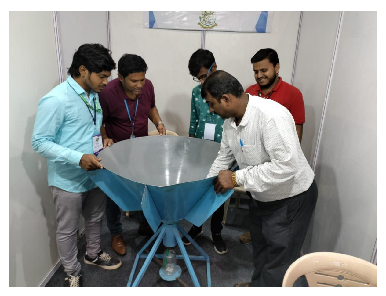
Our professors putting up some key highlights of the model's fabrication segment