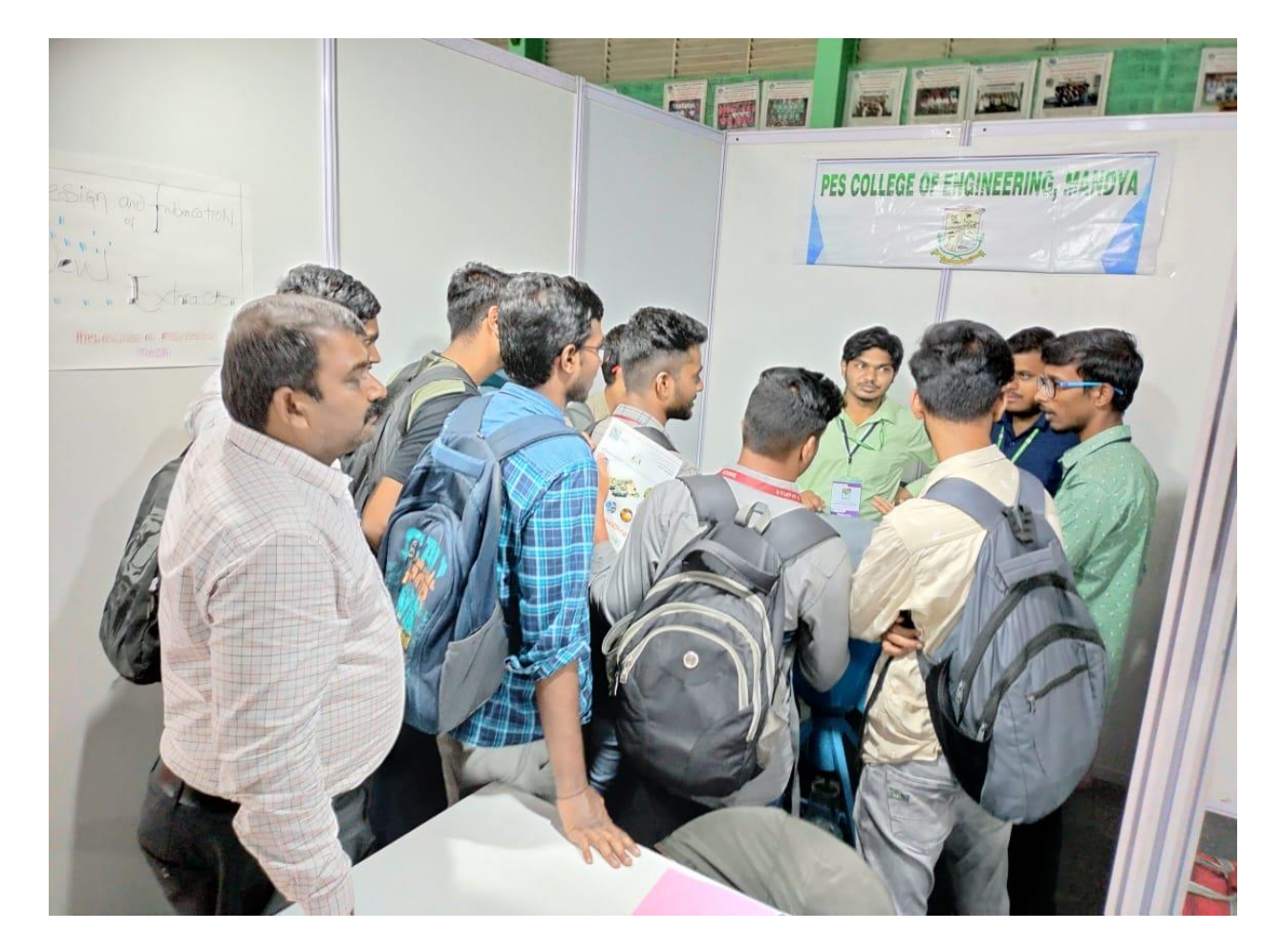
One of our team members entertaining the visitor students with the fabrication and working of the model