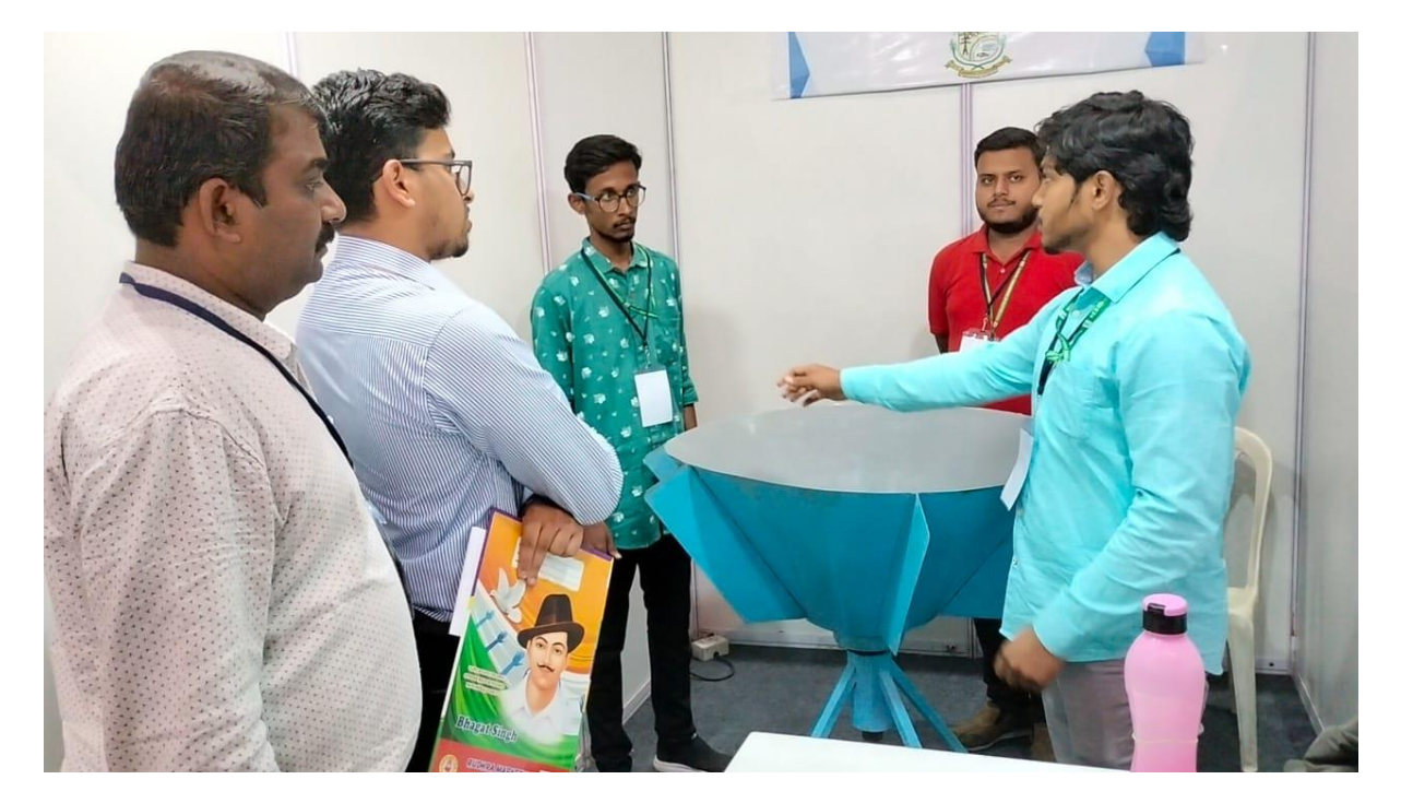
One of Our Team Members Explaining The Modelling And Fabrication Of The Model To One Of The Jury Member

The Second Day was an important one for us as it was the day when the jury members or the ones who had the judgement chair were to visit our stall and mark us on the basis of varied criteria be it explanation , modelling , fabrication or the results attained.