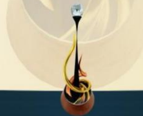
MEMBER SECRETARY, NBA